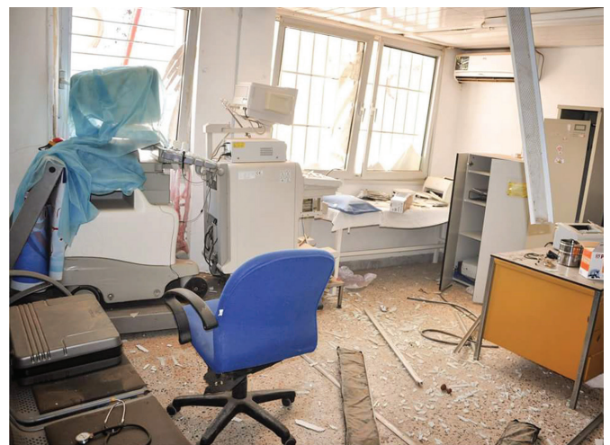
Damage to Sirt Iben Sena Hospital.

Explosive remnants of war (ERWs) and deliberately planted improvised explosive devices (IEDs) are a particular concern, and will likely render much of Sirt city inaccessible for the coming months. ERWs and IEDs contamination puts returning populations at risk of death or serious injury and will hinder reconstruction efforts. Given the need for debris clearance, mines and ERWs decontamination, it is cautioned that no large-scale returns into much of Sirt city should be permitted before the official declaration that the city has been cleared of ERWs and IEDs.