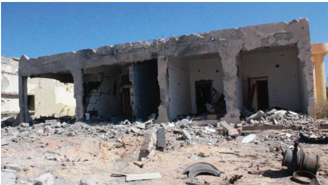
Destroyed buildings and ERWs in Sirt.